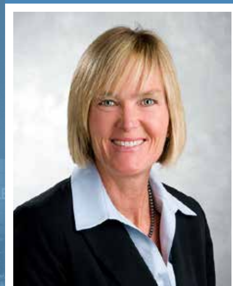
2021 WOMEN OF INFLUENCE IN LAW